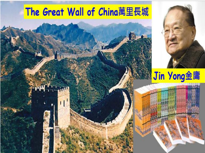
The Great Wall of China 萬里長城